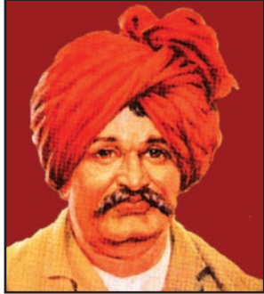
RAJARSHI CHHATRAPATI SHAHU MAHARAJ