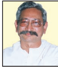
Shrimant Chhatrapati Shahu Maharaj, Kolhapur President